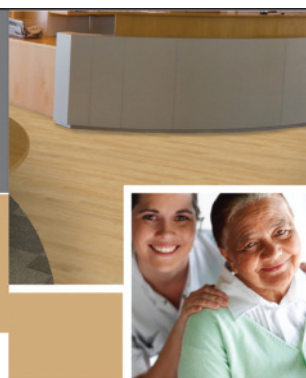
FLOORING SOLUTIONS MADE SIMPLE

Core Elements: Quite possibly the easiest business decision you'll make today!