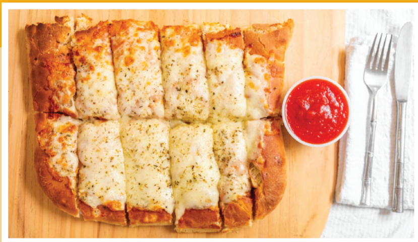
Cheese garlic sticks