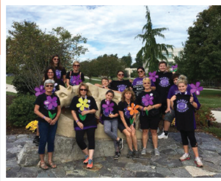
Members representing the Chestnut Knoll team pose for a group picture at Penn State, Berks Campus before participating in the 2017 Walk to End Alzheimer's on Oct. 7, 2017.

Chestnut Knoll's collaboration with FOX Rehabilitation provides every resident with state-of-the-art wellness programs. Individuals living with Parkinson's disease or other movement disorders benefit from evidence-based programs called LSVT BIG and LSVT LOUD. The FOX Optimal Living exercise program promotes overall wellness and has proven results!