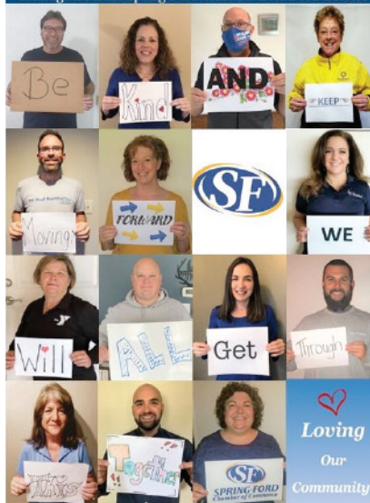
Message from the Spring-Ford Chamber Board of Directors

*See the Chamber website and facebook page for our Zoom Room link.