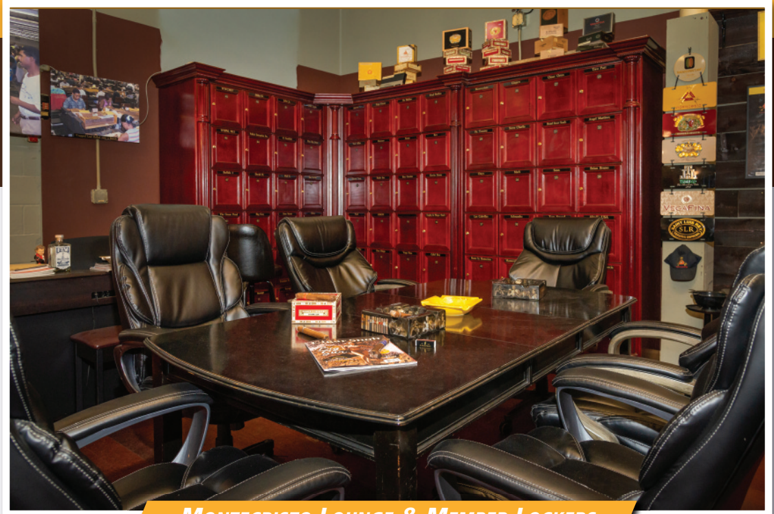
MONTECRISTO LOUNGE & MEMBER LOCKERS

“We decided to go with a brick-and-mortar store because you could have people come in and enjoy the experience and lifestyle of cigar smoking,” he said. “People come in and discuss the binder, filler and wrapper of a cigar, where it’s rolled . . . it’s a more educated group of consumers.”