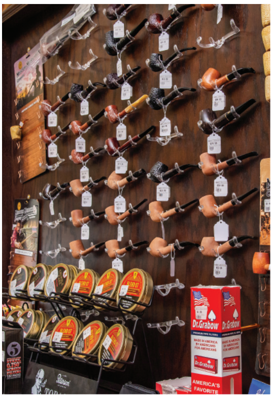
Pipes and Pipe Tobacco