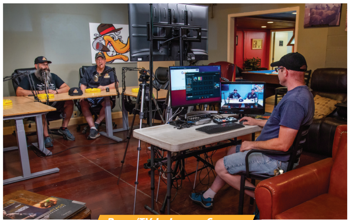
RADIO/TV IN-LOUNGE STUDIO