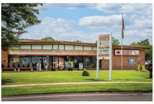
Located at 250 West Ridge Pike in Limerick

“At the tender age of 55 I became an entrepreneur,” he said. “It was a huge risk, but I knew the industry because I’d been in it for 30 years. If I can’t make it in this industry, I can’t make it in any industry.”