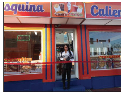
La Esquina Caliente restaurant/café in Reading.

GRCA, through its affiliate organization the Greater Berks Development Fund (GBDF), recognized the need to have an entity for small business lending in our community ($25,000 average), that is also coupled with the ability to provide technical assistance if needed. For example, NHS already has the infrastructure for credit counseling for those business owners who may need that service to obtain loans.