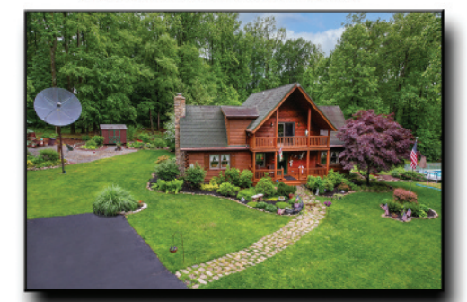
Certified FAA Drone Pilot