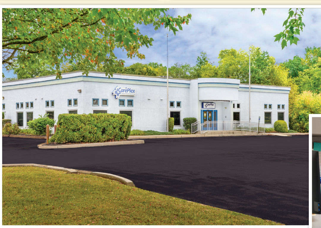
Occupational Health is part of the Pottstown Hospital CarePlex building located at 81 Robinson Street, Pottstown.