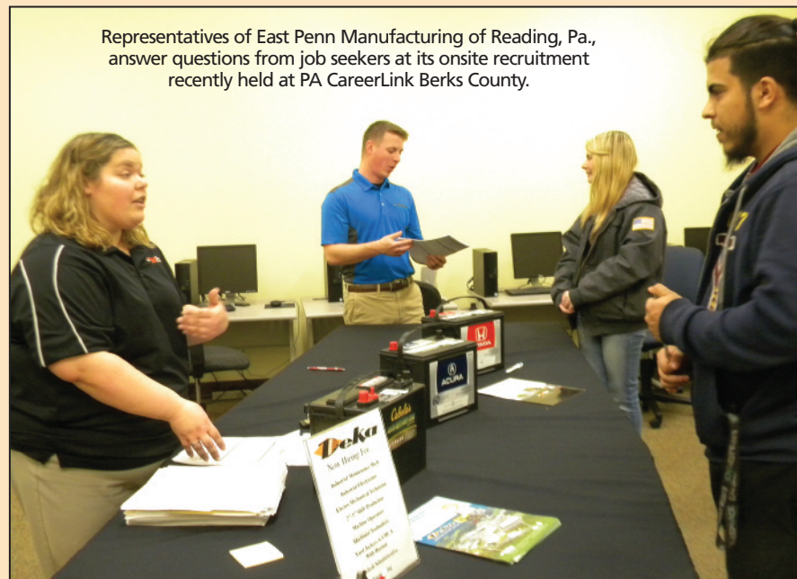
Representatives of East Penn Manufacturing of Reading, Pa., answer questions from job seekers at its onsite recruitment recently held at PA CareerLink Berks County.

The PA CareerLink has seen its onsite recruitment numbers steadily rise during the past year and feedback from participating employers has been outstanding. From small home healthcare agencies to large, established manufacturing companies, PA CareerLink has hosted recruitment events of all sizes.