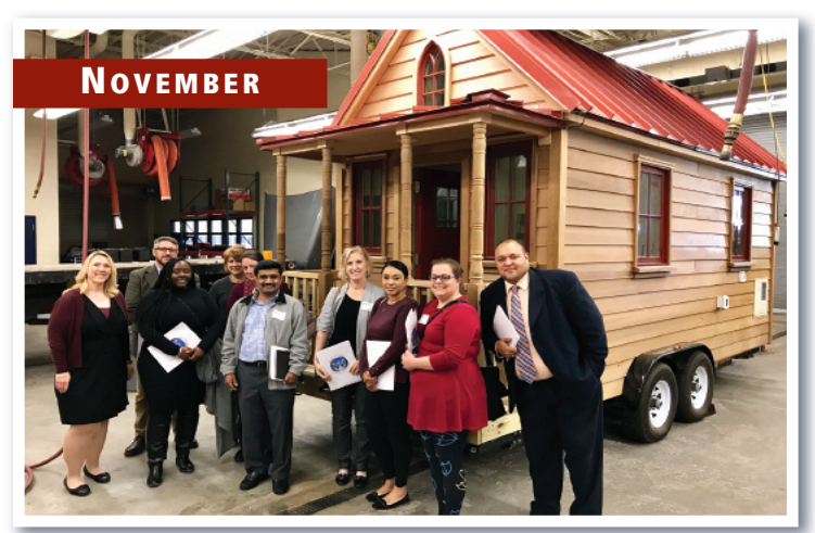
At the Western Montgomery Career & Technology Center tiny house.