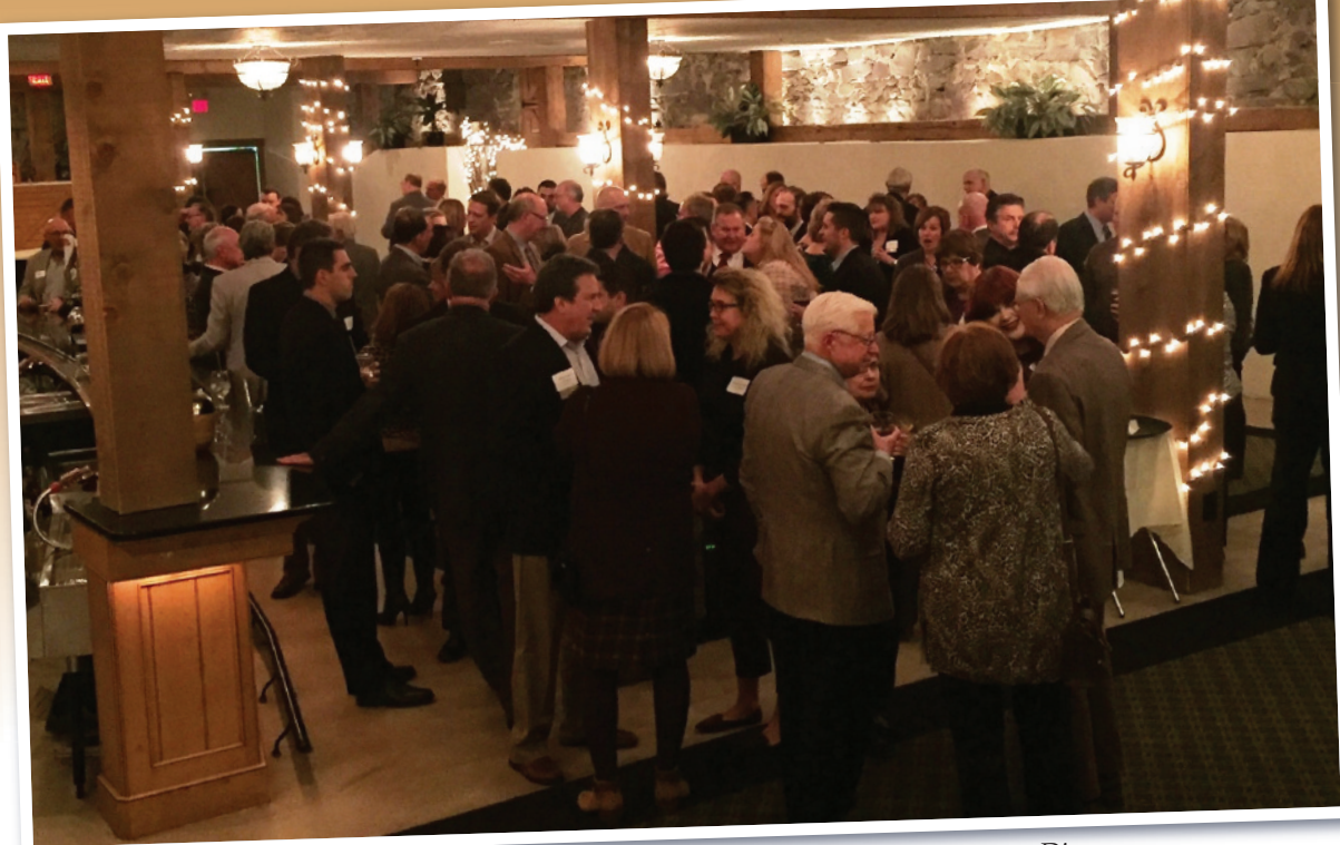
Attendees enjoying the networking portion of the Boyertown Area Progress Dinner.

On January 17, TriCounty Area Chamber of Commerce (TCACC) Members and guests gathered at LaMassaria at Bella Vista Golf Course for the 33rd annual Boyertown Area Progress Dinner.