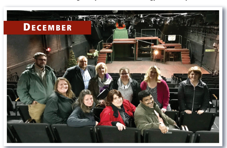
At Steel River Playhouse