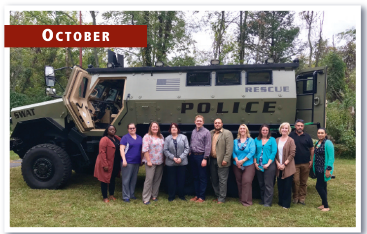
The Class of 2018 with the MSWAT-West armored SWAT vehicle.