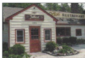
Filming Site for The Happening