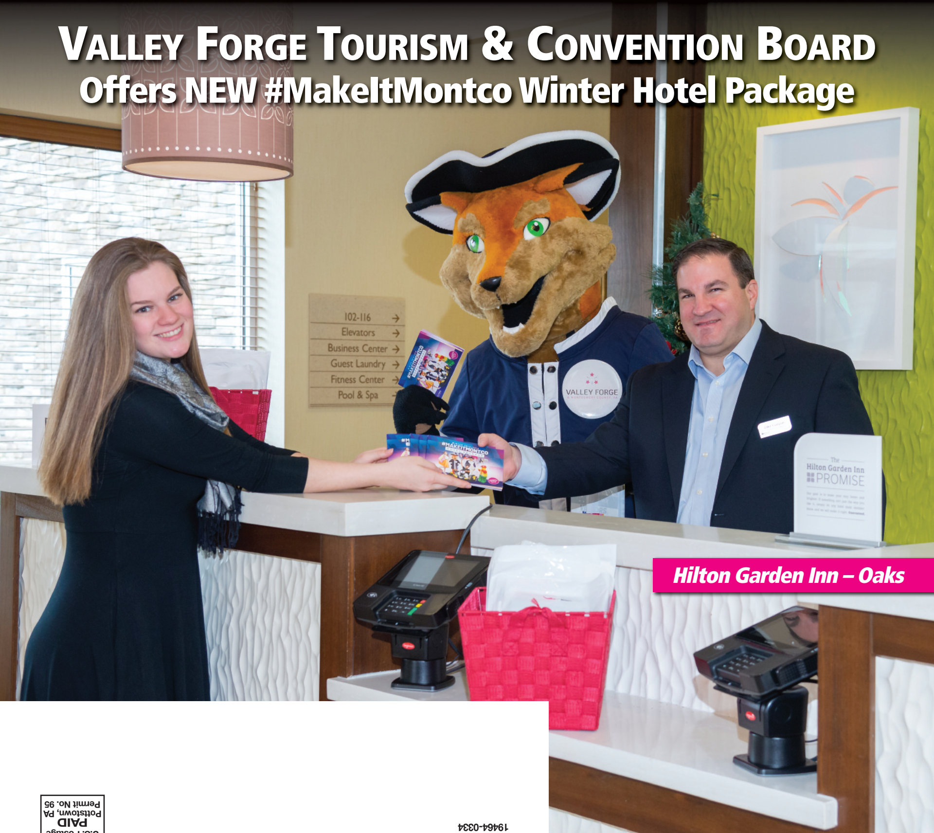
Hilton Garden Inn – Oaks

Presorted Standard U.S. Postage PAID Pottstown, PA Permit No. 95