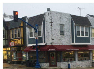
Office at 300 Bridge Street, Phoenixville

Visit the Phoenix Tax Consultants website at www.taxtacklers.com or call the office at 610.933.3507 and learn how PTC can make a difference for you.