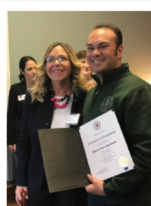
Mayor Peter Urscheler