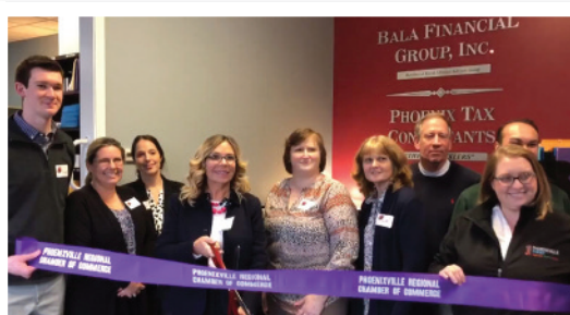
The Award Winning Staff