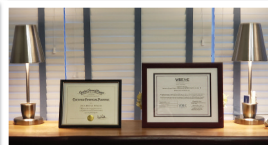
CFP & WBENC Certifications