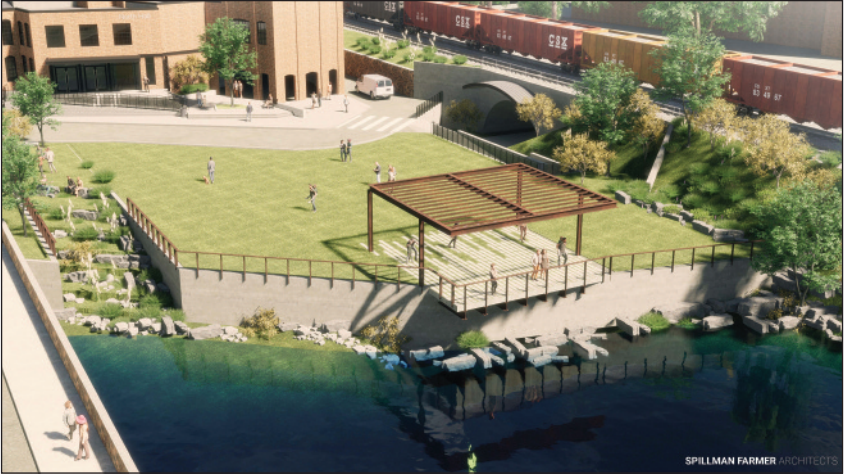
Montgomery County Community College is transforming its North Hall parking lot into a green space to provide live learning laboratories for students and a public green space for the community. Rendering courtesy of Spillman Farmer Architects

For more information about Montgomery County Community College, and its campuses and programs, visit mc3.edu.