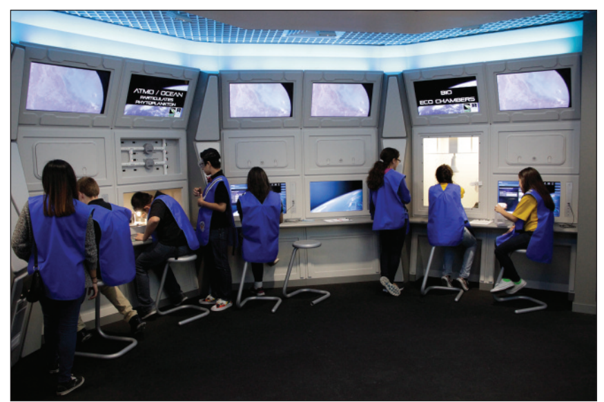
Montgomery County Community College is partnering with Challenger Center to open the first interactive, space-themed Challenger Learning Center in Pennsylvania at its Pottstown Campus.

pathway will help to strengthen the workforce for Montgomery County and the region."