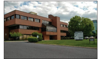
Stewart Abstract of Berks County, Inc., located at 1100 Berkshire Blvd #100, Wyomissing, PA 19610.

Our staff will take care to locate the issues before your scheduled settlement and handle them in a way that will, in most cases, allow your settlement to proceed without delay. Insurance policies, written by title insurance companies, provide protection against