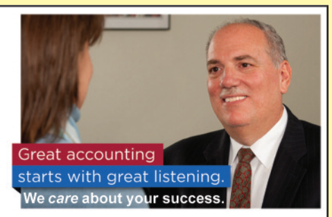
Contact us today for a free consultation: