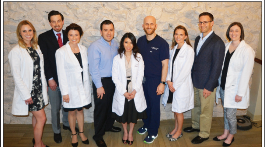
Board Certified Dermatologists

FOR ALL YOUR MEDICAL & SURGICAL DERMATOLOGY NEEDS