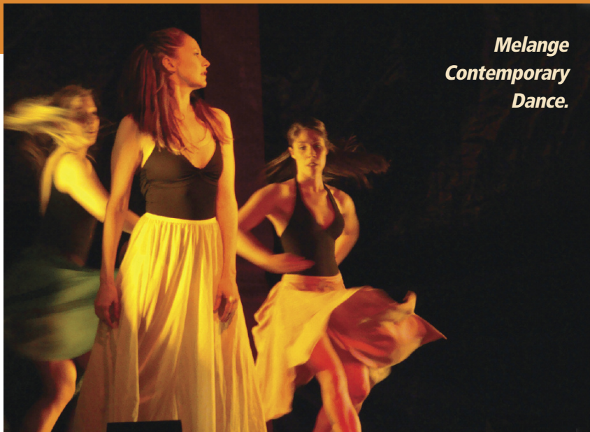
Melange Contemporary Dance.