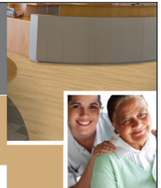
FLOORING SOLUTIONS MADE SIMPLE