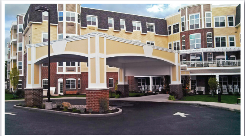
Muhlenberg Greene Architects can work with you as part of your team throughout design and construction. We designed the adaptive reuse project Keystone Villa at Ephrata as a design/build project in partnership with Hollenbach Construction.