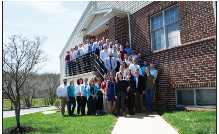
Pottstown HQ Pic: Pictured is TPD's staff located at their headquarters in Pottstown.

Sponsor the Movement! Corporate sponsorships are available. Visit: https://tcnetwork.org/the-amazing-raise/ for more details!