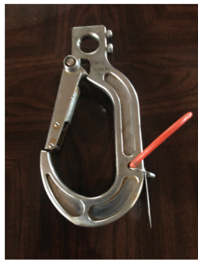
Dual Spring Hook

At SmartCost Incorporated, they provide functional leadership and support within manufacturing and supply chain operations. Their solutions are focused on digitizing to digitalizing operations, helping customers with their Digital Transformation initiatives no matter where they are in their growth journey. They build highly connected Business Processes to help companies scale and integrate seamlessly. With a focus on Lean and Six Sigma, they identify & eliminate redundancies and waste within operations utilizing data and simulation software. SmartCost has partnered with Tulip Inc, the leader in frontline operations, to provide a no-code MES and systems integration platform. And with dashboard development and custom IIoT solutions, SmartCost provides Data Acquisition and Analytics support as well as crisis management & business continuity planning as part of their Program Management support.