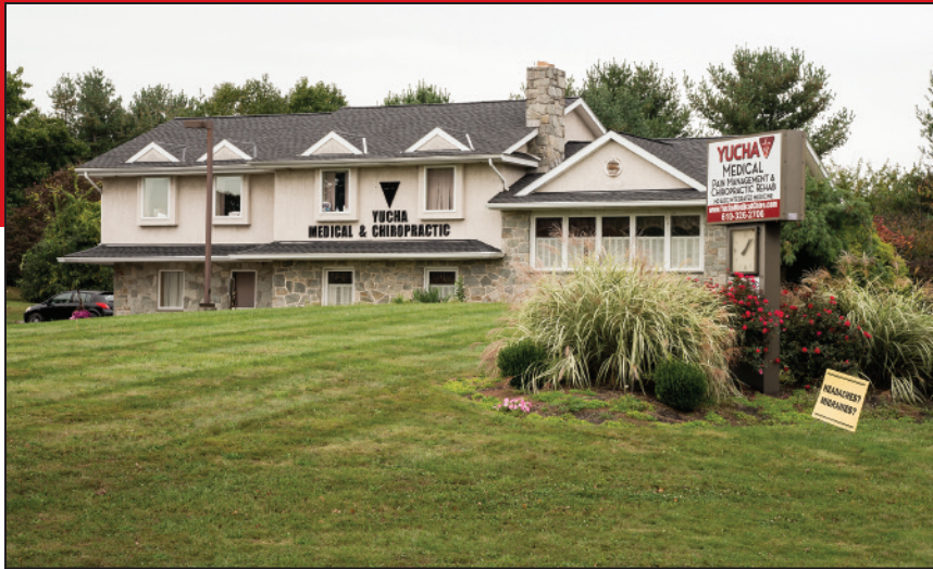
Yucha Medical Pain Management & Chiropractic Rehabilitation is located at 435 West Cedarville Road, Pottstown, PA 19465.