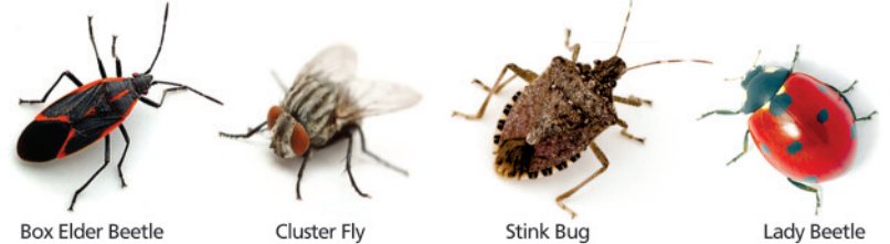
Box Elder Beetle