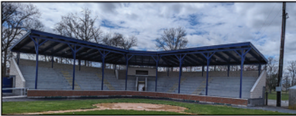
Quakertown Memorial Park Baseball Stadium Reconstruction

Hollenbach Construction, Inc. can provide your business with Professional Construction Management Services and Design Build Services for your New Construction and Renovation projects. Let us take your projects from start to finish in the areas of: