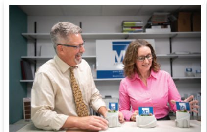
PORTRAIT PHOTOGRAPHY BY LAUREN LITTLE PHOTOGRAPHY