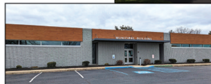
New Hanover Township Administration Building

Hollenbach Construction, Inc. can provide your business with Professional Construction Management Services and Design Build Services for your New Construction and Renovation projects. Let us take your projects from start to finish in the areas of: