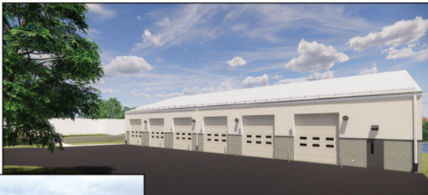
New Hanover Township Administration Building

Operations Department Garage Pennridge School District