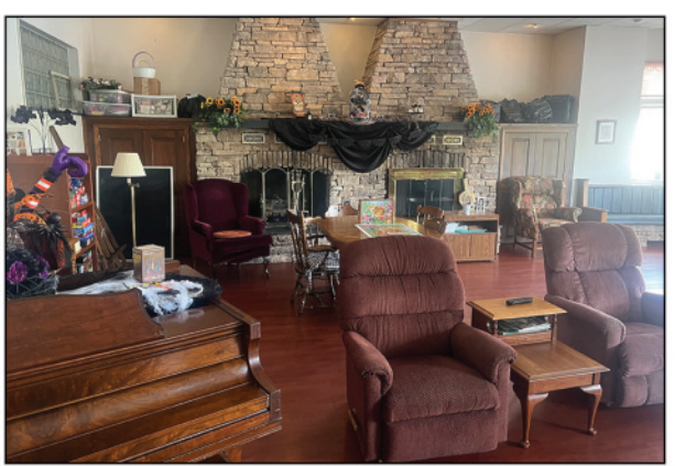
PLEASE CALL TODAY for the Best Choice in Personal Care!