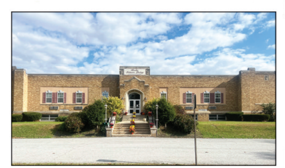
Affordable Personal Care Studio • Private • Semi-Private Room Prices Starting at $2,250/Month