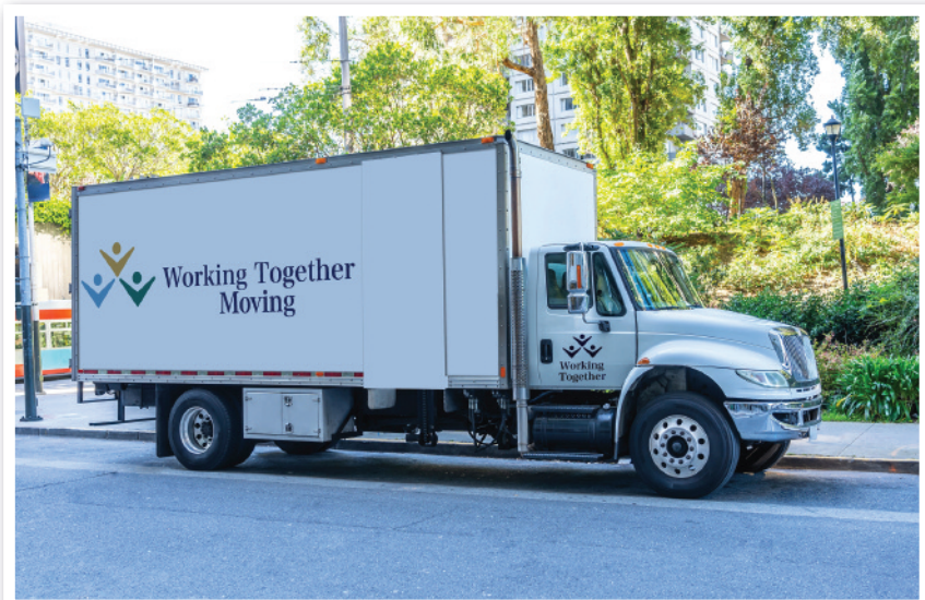
If you are moving, get a quote from Working Together.

Ask for a quote 610 590 5777 OR go to the website www.WorkingTogether.work