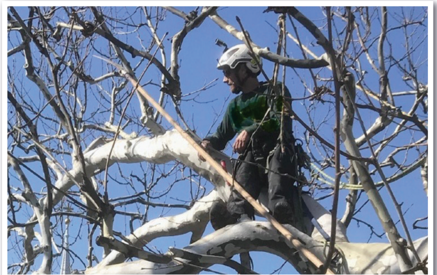
For Tree Removal or Tree Pruning, get a quote from Working Together.