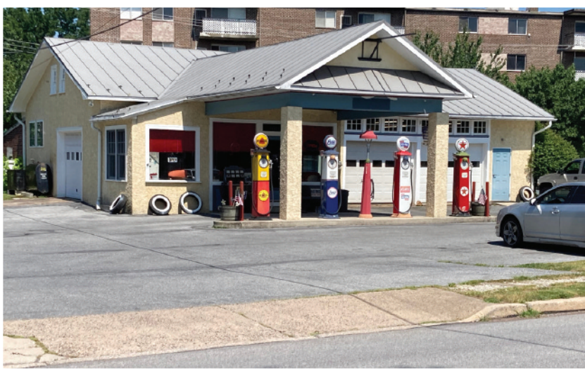
In 2023, Working Together acquired Ellis Automotive at 601 Farmington Ave in Pottstown.