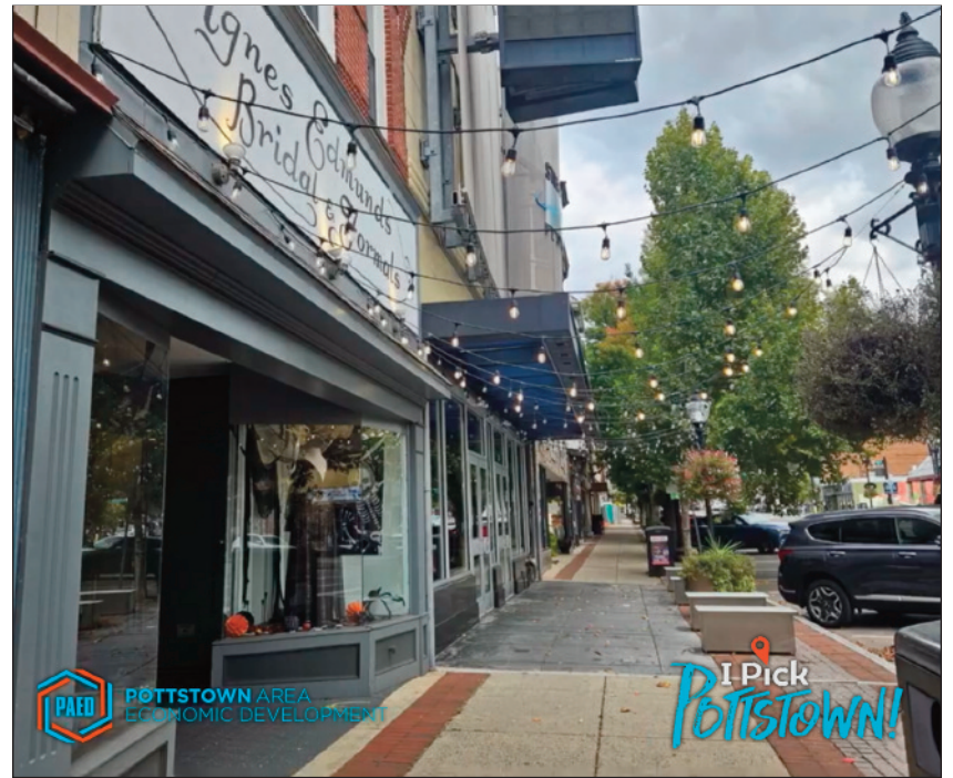
Light Up High Street will continue throughout the Downtown blocks of High Street, as PAED works diligently on additional funding opportunities and coordinating with Pottstown's Downtown building owners and businesses. Creating the canopy of lights accomplishes many things. It brings visual appeal to the Downtown and it enhances public safety.

• Dana Incorporated – For over 100 years, Dana has been one of Pottstown's largest employers, manufacturing and supplying parts to the passenger and medium and heavy-duty commercial vehicle manufacturers.