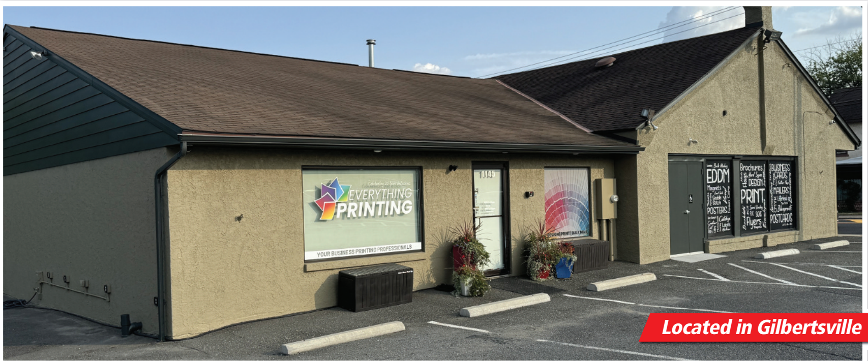
Located in Gilbertsville

Everything Printing was recently repainted, expressing their long-term commitment to the community.