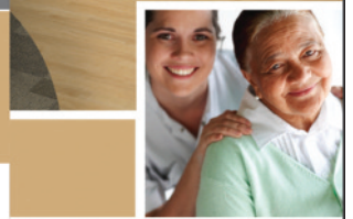
FLOORING SOLUTIONS MADE SIMPLE

Core Elements: Quite possibly the easiest business decision you'll make today!