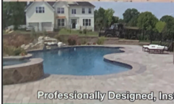
Professionally Designed, Installed & Warranted Hardscapes