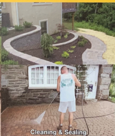
Cleaning & Sealing