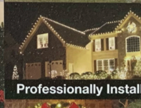
Professionally Installed Commercial & Residential Lighting