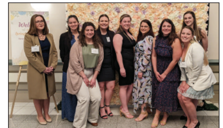
TPD Women at WTS Philadelphia Event