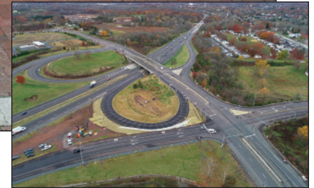
Route 422 Sanatoga Interchange Improvements

Traffic Planning and Design, Inc. (TPD) is a multi-disciplined A/E/C firm headquartered in Pottstown, with additional offices across Pennsylvania, as well as in New Jersey, Maryland, North Carolina and South Carolina. We exist to improve the quality of life for the public, working toward this mission by providing design and construction services related to highway, bridge, traffic and multimodal projects for a range of public and private sector clients throughout the eastern US.