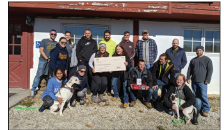
TPD Volunteers – Maine Line Animal Rescue