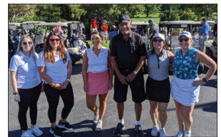
TPD Golf Outing

Based on performance, growth, practices and our staff members' valued opinions, TPD has once again been ranked on several esteemed local and national lists of top firms and performers: