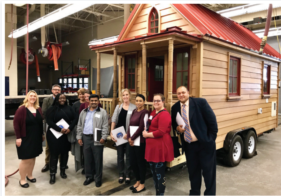
At the Western Montgomery Career & Technology Center, the class was able to view a tiny house.