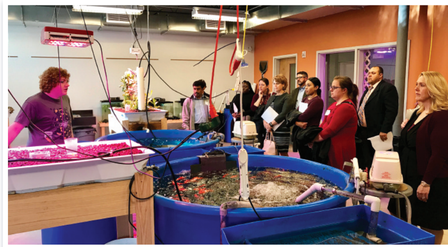
The class on their tour of MCCC's Sustainability and Innovation Hub.

The Leadership Tri-County Class of 2018 is sponsored by: