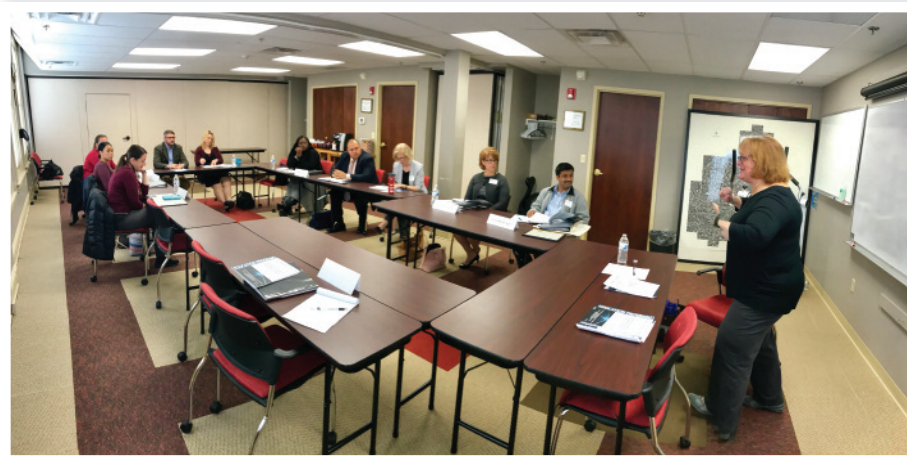
At the November session, the class had their first session of BoardCorps Bootcamp.