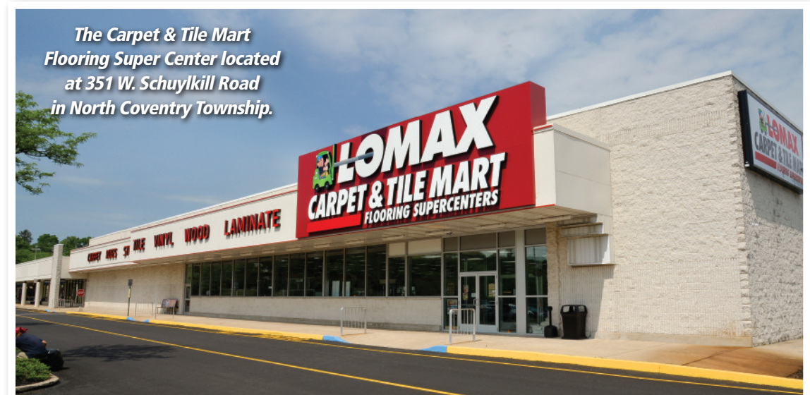
The Carpet & Tile Mart Flooring Super Center located at 351 W. Schuylkill Road in North Coventry Township.

A: We buy direct from mills and manufacturers for all flooring categories, eliminating middleman and mark-ups that are normally associated with flooring franchise stores, big-box home center flooring departments and floor covering buying group operations. Working closely with the mills and flooring suppliers for decades, we have also been able to maintain a superior product-quality level that