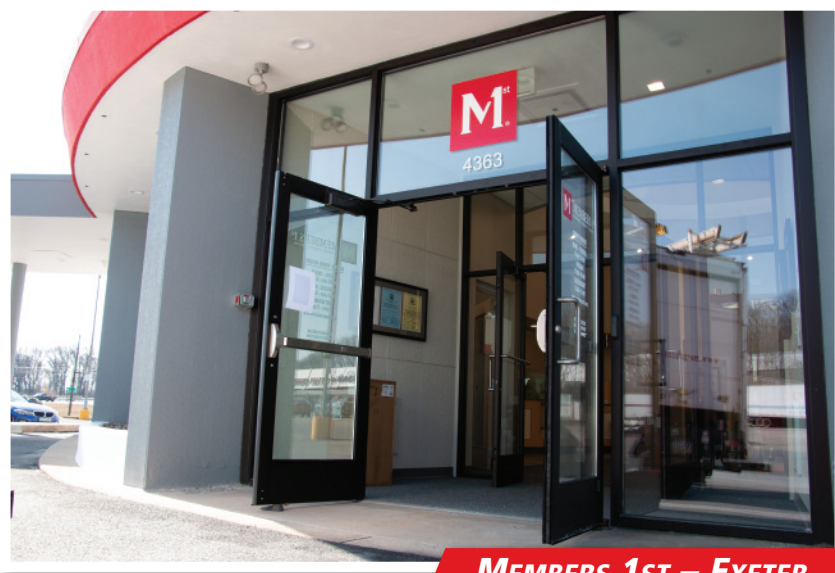
MEMBERS 1ST – EXETER

We offer our members several certificate options, so no matter your income, industry or goals, there is an option for everyone. Our business members can take advantage of certificates with flexible terms, certificates that allow you to withdraw your money when needed without penalties or fees, and certificates known as bump-up certificates, which ensure our members do not miss a better rate after they have opened a certificate. Visit Members1st.org/certificates to find the right low-risk, high-yield option for you and your business.