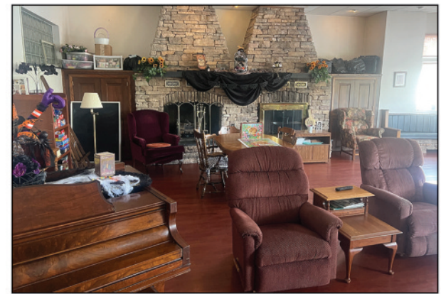
PLEASE CALL TODAY for the Best Choice in Personal Care!