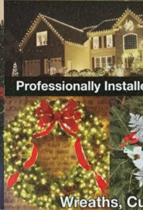
Professionally Installed Commercial & Residential Lighting