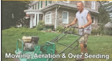
Mowing, Aeration & Over Seeding

Commercial & Residential Christmas Decorating Services Roof Lighting · Window Lighting · Daytime Decor Tree and Shrub Lighting · Takedown Service · Storage