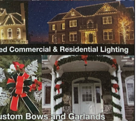
Wreaths, Custom Bows and Garlands