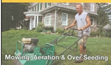
Mowing, Aeration & Over Seeding

Commercial & Residential Christmas Decorating Services Roof Lighting · Window Lighting · Daytime Decor Tree and Shrub Lighting · Takedown Service · Storage