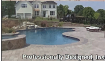
Professionally Designed, Installed & Warranted Hardscapes