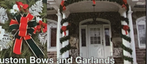
Wreaths, Custom Bows and Garlands