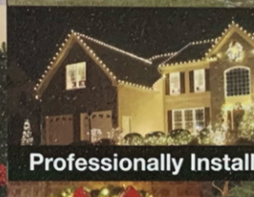
Professionally Installed Commercial & Residential Lighting