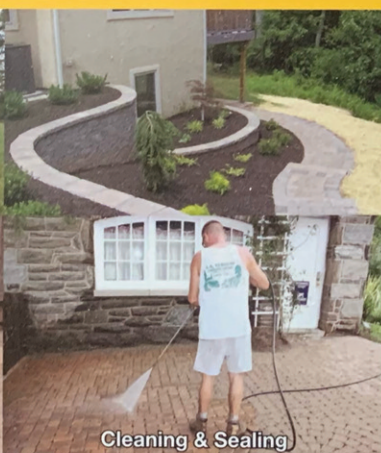
Cleaning & Sealing