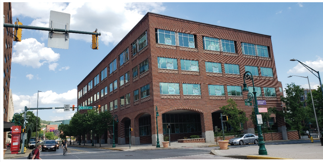
600 Penn Street