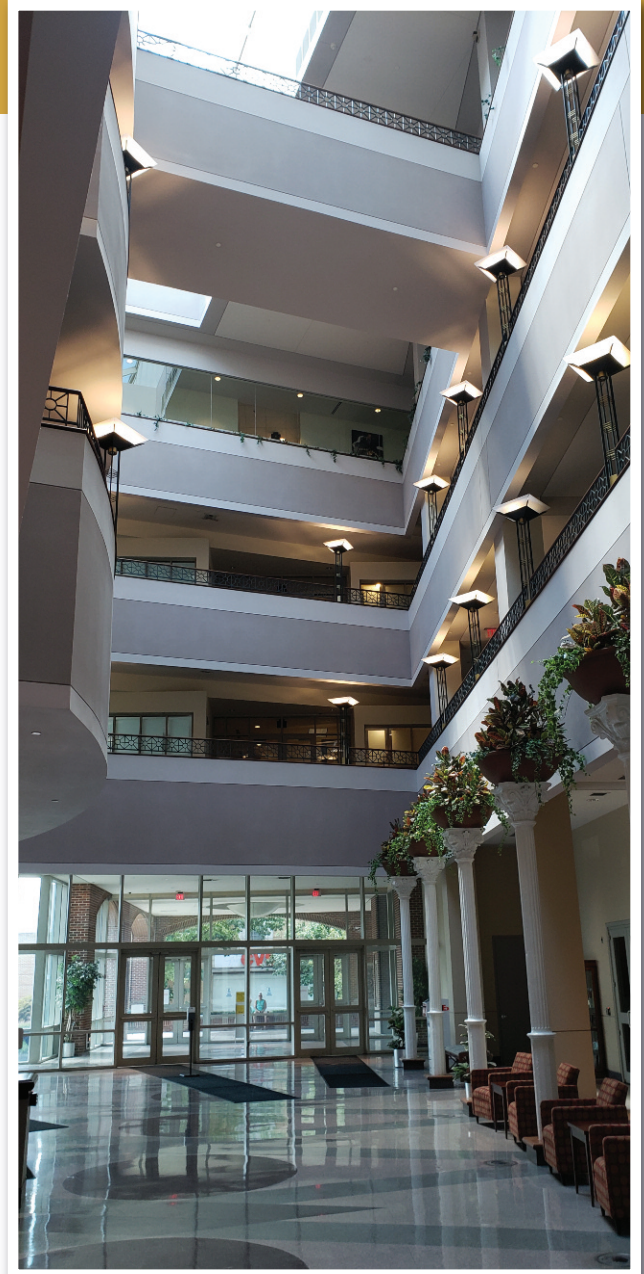
600 Penn Lobby

Shuman Development Group has a portfolio of some of the grandest structures in the City of Reading, filled with historical buildings restored to their past glory and state of the art, modern office complexes. We are proud owners of one of the oldest office buildings in Reading (35 North 6th Street - 1909) and the newest (600 Penn Street - 1995).