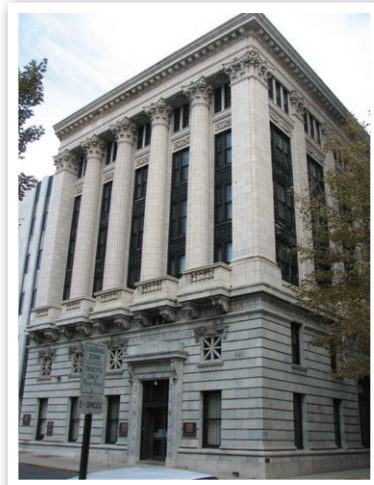
35 North 6th Street

We don't just know the area. The area knows us. At Shuman Development Group we believe that reputation matters. Through fairness and honesty, our employees work hard to maintain our well-known reputation. We dedicate ourselves to quality service, building trust, and always putting our tenant's businesses first.