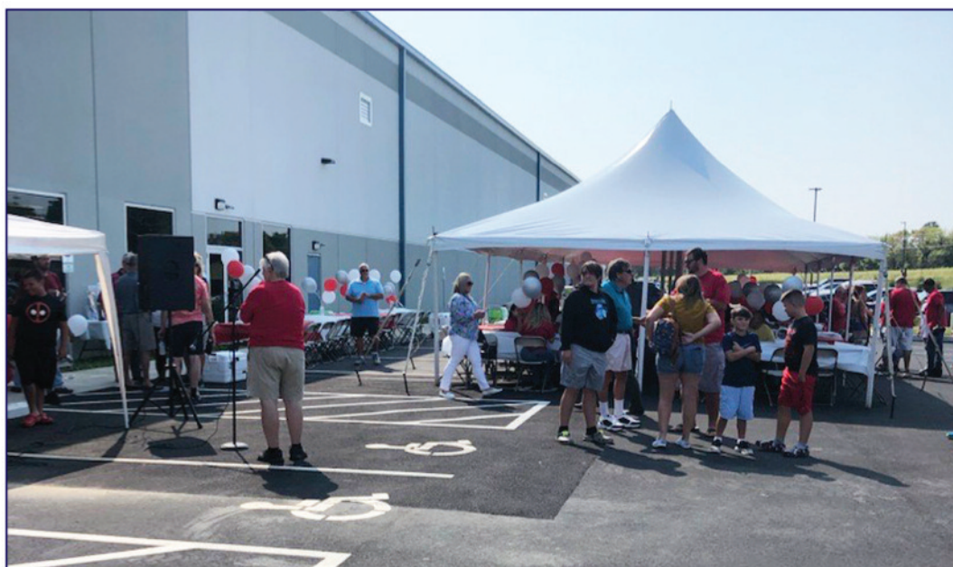
G&T Industries Grand Opening Celebration.

Specializing in foam and rubber fabrication, upholstery, and order fulfillment for the transportation, medical, furniture, military, electronics, HVAC, athletic, packaging and marine industries.