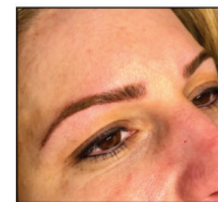
Micro Bladed Brow with Healed Top and Bottom Eyeliner