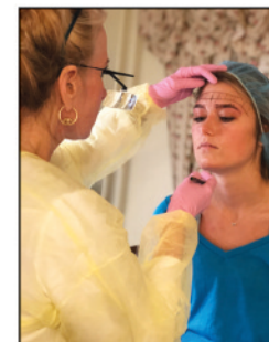
Brow Mapping Before Micro Blading Brow Procedure