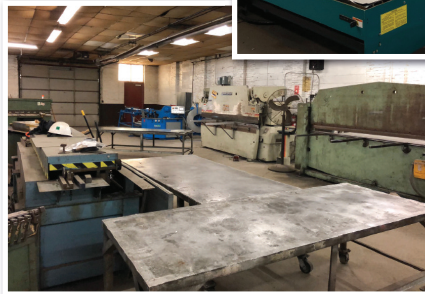
Spiral machine, brakes, and shop equipment

Blanski Energy Management is headquartered at 1835 Pear Street, Reading PA 19601.