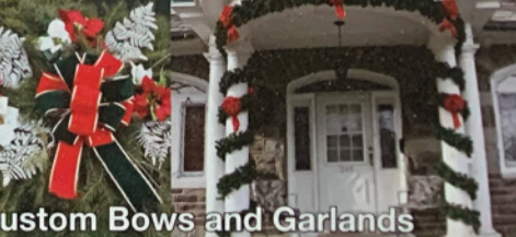
Wreaths, Custom Bows and Garlands