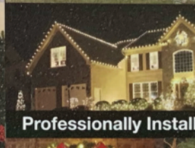
Professionally Installed Commercial & Residential Lighting