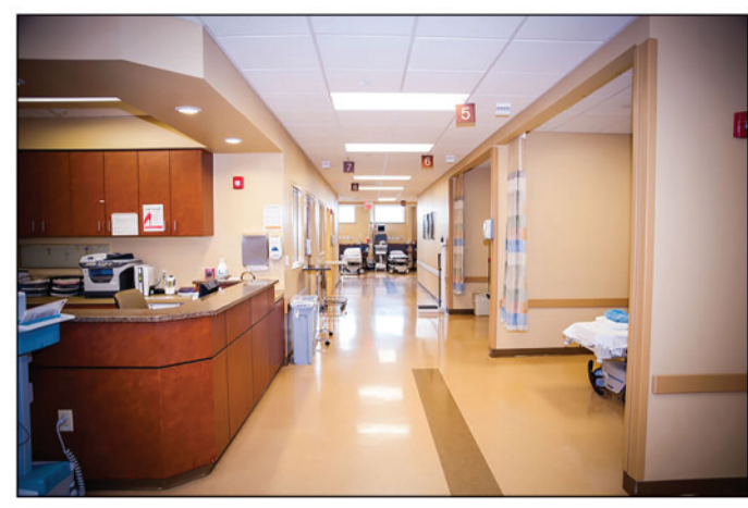
PCSH specialties include: Orthopedic Surgery, including robotic knee replacement, General Surgery, Gynecology, Ophthalmology, and Otolaryngology (ENT).

454 Enterprise Drive, Royersford, PA 19468 610.495.3203 www.phycarehospital.com