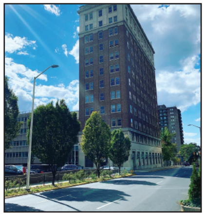
The Madison Building, Reading, PA.

D&B Construction offers a variety of services for all types of businesses and organizations in Pennsylvania, New York, New Jersey, and Delaware. Services include pre-construction consulting, developmental studies, design/build, general contracting, construction management, and on-site management consulting. We provide counsel, expertise, and action in all manners of commercial construction for retail, office, hospitality, senior living, medical, religious, industrial, multi-family, and pre-engineered buildings. Our team of experienced industry leaders can retrofit older and historic buildings for adaptive reuse to suit your company's needs, or design and build an entirely new facility from the ground up. Whether it's an upgrade to existing structures or a new build, D&B carries your vision from an idea to completion on-time and on budget.