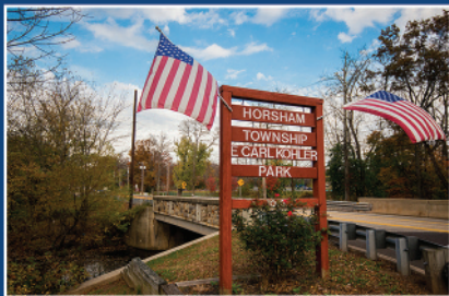
Site Planning and Design Montgomery County, PA