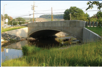
Bridge Replacement Berks County, PA

PROVIDING CIVIL ENGINEERING SERVICES FOR OVER 40 YEARS