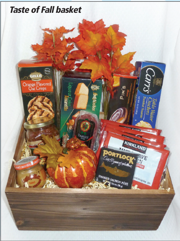
Taste of Fall basket