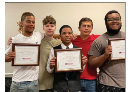
Spring 2022 High School Welding Internship Program Recognition Ceremony.

employment to start upon graduation as a full-time welder. The program consists of classroom training, hands-on training, and on-the-floor training.