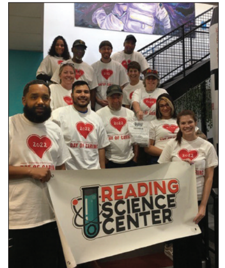
Morgan Truck Body team members participating in Day of Caring for the United Way.

Morgan Truck Body started their 2022 fall welding internship program September 6th. There are 8 local high school seniors participating from Coatesville Area Senior High School, Wilson High School, and Chester County Intermediate Unit Learning Center. The Welding Internship Training Program will certify school aged students to become entry level certified Morgan Welders. Students participating in the program may be offered regular